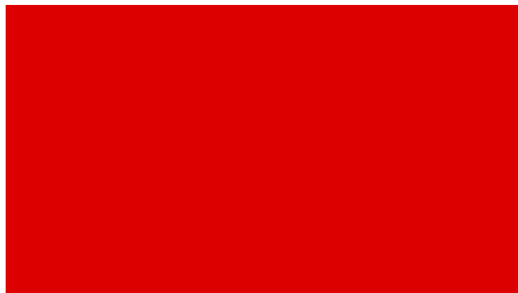
Figure 4: Plain Red Flag- Left-Wing Politics Since the French Revolution (1789–1799)