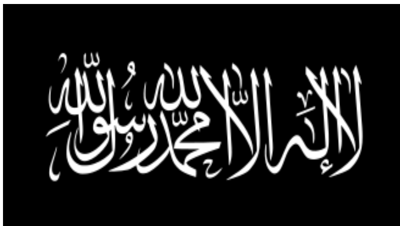
Figure 2: The "Black Flag of Jihad" Used by Jihadist Militants in late 1990s